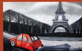
Sofia, Age 13, Oil