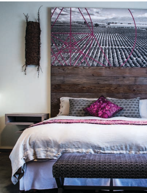
↑ A guest room at Finca La Divina

Also just outside Francisco Zarco, in the El Provenir area, sits Hotel Boutique Valle de Guadalupe —a 21-room, family-run property with exquisitely landscaped grounds, a wine cave for local tastings, large pool, Jacuzzi, organic garden and a stable with horses, goats, sheep and peacocks. There's also the mountain-view Fuego restaurant and bar, which offers covered outdoor seating overlooking the vineyards. On the menu: spicy lamb tacos, tuna tostadas and Brussels sprouts with garlic jelly. An array of activities can be enjoyed on site and nearby, including cycling, billiards and table tennis. The property also offers hot-air balloon rides, helicopter tours and guided-horseback-riding trips. hoteldelvalledeguadalupe.com