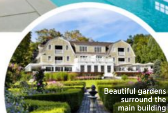
Beautiful gardens surround the main building

LUXURY HIDEAWAY A two-hour drive from New York, the elegant and serene Mayflower Grace hotel in Washington, Connecticut, suits those seeking a girls' getaway or a couple's long weekend of straight-up pampering. gracehotels.com/mayflower; 860-868-9466.