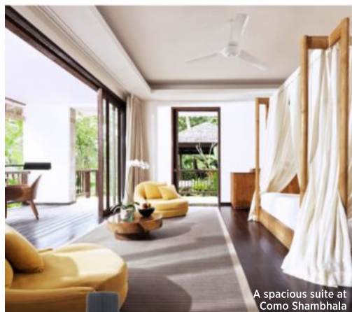
A spacious suite at Como Shambhala