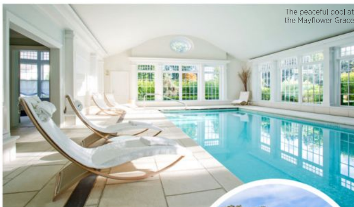
The peaceful pool at the Mayflower Grace

Situated among the vineyards of Château Smith Haut Lafitte outside Bordeaux, France, Les Sources de Caudalie spa features antiaging Vinotherapie treatments, including the popular Red Vine Barrel Bath. Tranquil days are best capped off at the Michelin-starred restaurant. sources-caudalie.com; 011-33-05-57-83-83-83.