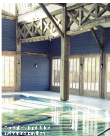
Caudalie's light-filled swimming pavilion

TROPICAL BLISS Located in the heart of a Costa Rican national park, Nayara Springs offers services inspired by its natural setting. Facilities include private, open-air pavilions tucked away in the rain forest; the spa menu features volcanic mud wraps, Costa Rican coffee body scrubs, and aromatherapy. You're welcome to zip-line through the jungle too. nayarasprings.com; 888-332-2961.