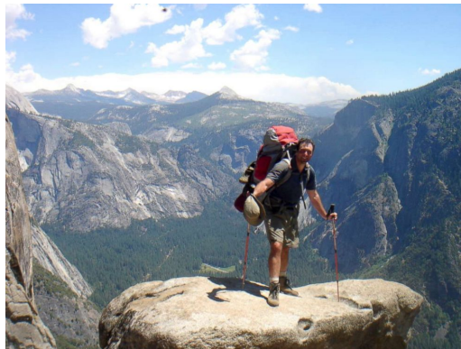
Fatpacking trips are designed for outdoor enthusiasts who want to lose weight.

Another weight-loss hiking vacation, Fatpacking is, according to its web site "targeted for people who are approximately 15-75 pounds overweight, but that's mostly a guideline." There are half-week, week-long and two-week-long trips and participants should be prepared to rough it -- no spa treatments here; instead, guests will spend their nights camping out in some of the nation's most spectacular locations, including national parks. A sample trip of the Grand Canyon tri-rim includes between 7 and 12 miles per day, including two ascents from the Colorado River. Other trips take place in Acadia National Park, Yellowstone and Yosemite, among others.