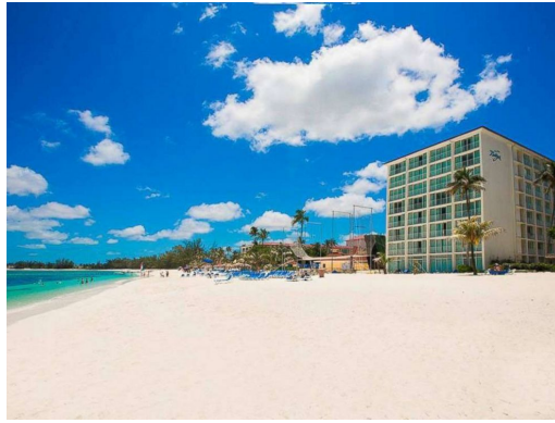
A resort beach is pictured in a promotional photo for Breezes Resort & Spa in the Bahamas.

Breezes Resort & Spa -- Bahamas is teaming up with Crunch Fitness and health expert Dr. Rachel to host its first Wellness Week April 23 through April 27. For five days, the all-inclusive resort will transform into a wellness retreat with a full program of daily group exercise classes, culinary workshops, discussions about mindfulness and making healthy life choices, as well as healthy behavior challenges and games. Featured classes include beach yoga, Caribbean rhythms dancing, and Zumba, plus more adventurous options like flying Pilates and trapeze conditioning. Between sessions, retreat-goers can attend cooking demonstrations.