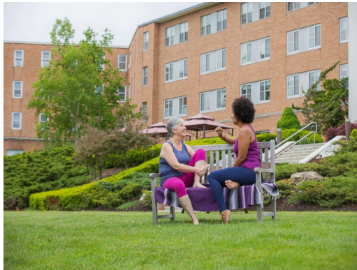
Kripalu is housed in a former Jesuit seminary.

Housed in a former Jesuit seminary, Kripalu is a perfect getaway for someone looking to incorporate a yoga retreat with a focus on rebooting their mental state, as well. The center's R&R package includes a variety of workshops, outdoor activities and of course, multiple yoga classes at different levels throughout the day. Meals in the cafeteria -- where healthy, organic food is served buffet style -- are taken in silence.