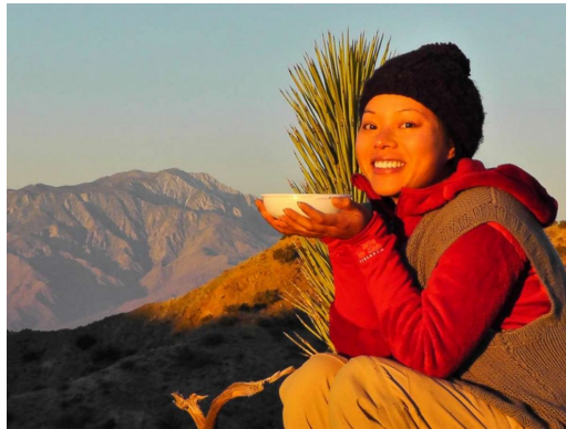
Fatpacking trips take place all over the country.

Another weight-loss hiking vacation, Fatpacking is, according to its web site "targeted for people who are approximately 15-75 pounds overweight, but that's mostly a guideline." There are half-week, week-long and two-week-long trips and participants should be prepared to rough it -- no spa treatments here; instead, guests will spend their nights camping out in some of the nation's most spectacular locations, including national parks. A sample trip of the Grand Canyon tri-rim includes between 7 and 12 miles per day, including two ascents from the Colorado River. Other trips take place in Acadia National Park, Yellowstone and Yosemite, among others.