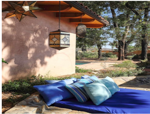
Rancho La Puerta is a fitness resort located in Tecate, Mexico.

Rancho La Puerta , often called the "original" fitness resort, says it gives guests a fresh start both physically and spiritually. Familiar workouts like TRX, yoga, pilates and hiking are on offer. New this spring is a redesigned course for obstacle course racing which includes mud pits, monkey bars and more; Bounce, a group class done on mini trampolines; workouts and aerial yoga, a new 45-minute class that uses silks to bring yoga poses above ground in a hammock-like contraption. Spa treatments, daily lectures and cooking lessons round out the healthy offerings.