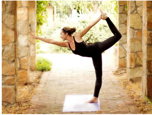
Rancho La Puerta is a fitness resort located in Tecate, Mexico.

Rancho La Puerta , often called the "original" fitness resort, says it gives guests a fresh start both physically and spiritually. Familiar workouts like TRX, yoga, pilates and hiking are on offer. New this spring is a redesigned course for obstacle course racing which includes mud pits, monkey bars and more; Bounce, a group class done on mini trampolines; workouts and aerial yoga, a new 45-minute class that uses silks to bring yoga poses above ground in a hammock-like contraption. Spa treatments, daily lectures and cooking lessons round out the healthy offerings.