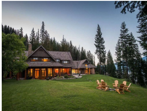
The exterior of Mountain Trek Lodge, British Columbia.

It sounds like a workout, but Mountain Trek is also the name of an award-winning fitness retreat. The week-long hiking program starts its spring season on April 28 with personalized programs for guests housed in a luxury lodge. Calorie-counted cuisine, three or four daily hikes, health coaching, nutrition lectures, a daily detox and spa treatments make up the program that boasts an average weight loss of 4.5 to 6.5 lbs for women and 8 to 10 lbs weight loss for men, per week. The retreat is tech-free, so plan for a phone detox, too. Groups are limited to 16 people per week.