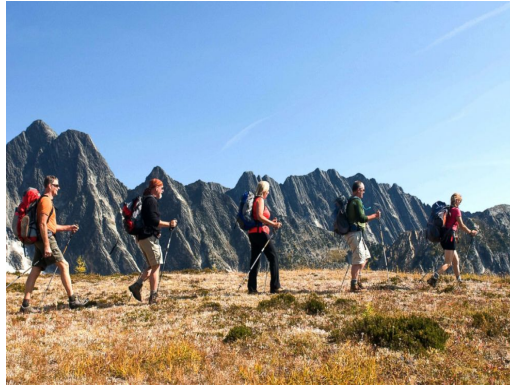
Guests take part in as many as four hikes per day at Mountain Trek.

It sounds like a workout, but Mountain Trek is also the name of an award-winning fitness retreat. The week-long hiking program starts its spring season on April 28 with personalized programs for guests housed in a luxury lodge. Calorie-counted cuisine, three or four daily hikes, health coaching, nutrition lectures, a daily detox and spa treatments make up the program that boasts an average weight loss of 4.5 to 6.5 lbs for women and 8 to 10 lbs weight loss for men, per week. The retreat is tech-free, so plan for a phone detox, too. Groups are limited to 16 people per week.