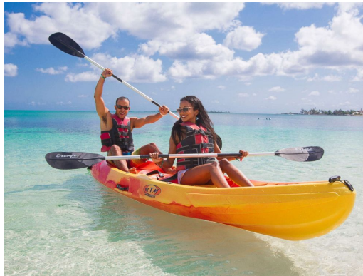
A man and woman use a kayak in a promotional photo for Breezes Resort & Spa in the Bahamas.

Breezes Resort & Spa -- Bahamas is teaming up with Crunch Fitness and health expert Dr. Rachel to host its first Wellness Week April 23 through April 27. For five days, the all-inclusive resort will transform into a wellness retreat with a full program of daily group exercise classes, culinary workshops, discussions about mindfulness and making healthy life choices, as well as healthy behavior challenges and games. Featured classes include beach yoga, Caribbean rhythms dancing, and Zumba, plus more adventurous options like flying Pilates and trapeze conditioning. Between sessions, retreat-goers can attend cooking demonstrations.