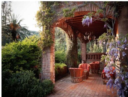
Rancho La Puerta is a fitness resort located in Tecate, Mexico.

Weekly rates start at $4,400 for singles, and $3,900 for doubles.