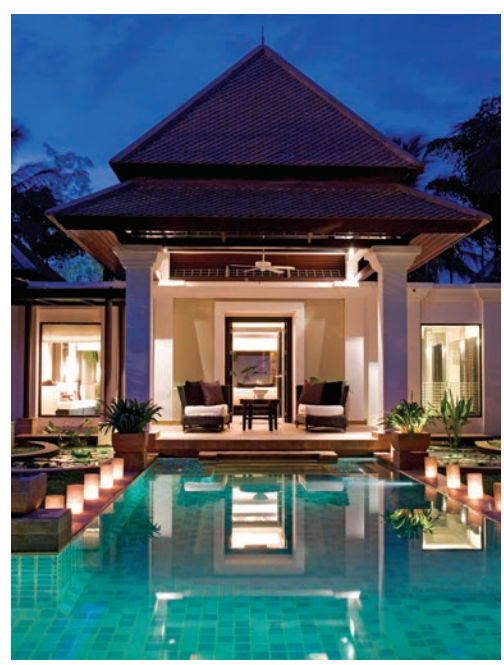
SPA VILLA AT BANYAN TREE PHUKET