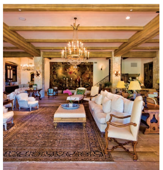
CLOCKWISE FROM TOP LEFT: THALASSOTHERAPY POOLS AT VERDURA RESORT IN SICILY; CALIFORNIA'S CAL-A-VIE HEALTH SPA; A COMMON AREA AT CAL-A-VIE; OUTDOOR SPA TREATMENT ROOM AT TABACÓN IN COSTA RICA.