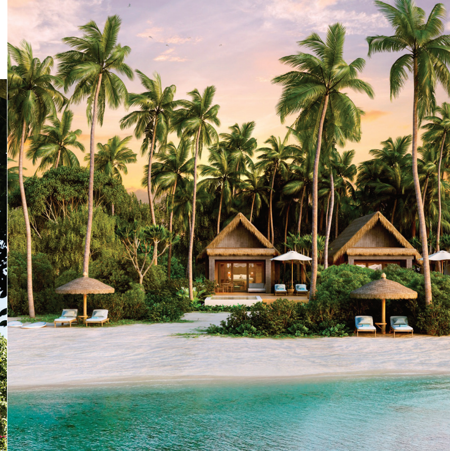
FROM FAR LEFT: CHABLÉ RESORT; SIX SENSES; RANCHO LA PUERTA

Whether your goal is to unplug, slim down, reset your mind, or simply submit to the world's most heavenly massage, these ELLE-approved spas have you covered. By April Long