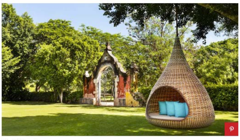
Chablé Resort