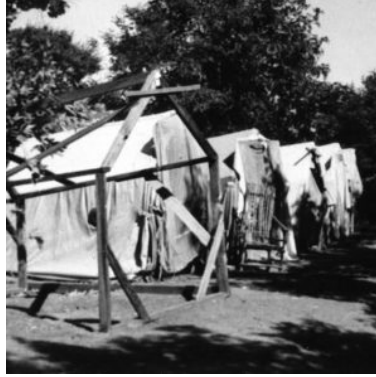
The Ranch's original canvas tents